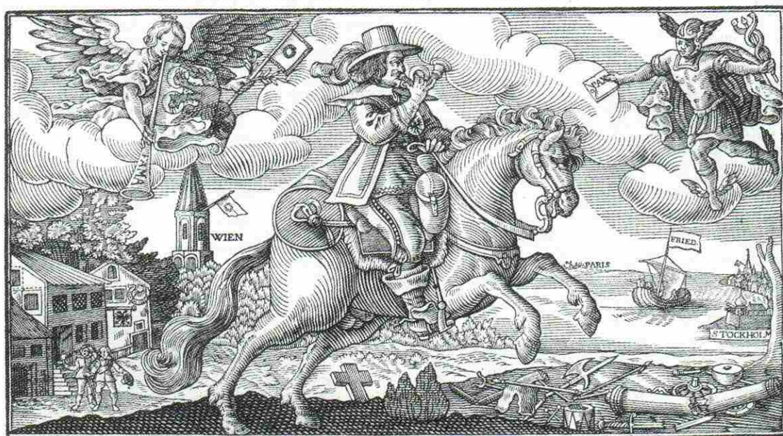
A German news-sheet proclaims the end of the Thirty Years' War on 25 October 1648.